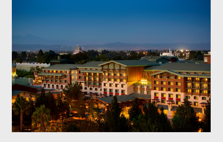
As to Disney artwork/properties: © Disney 2024